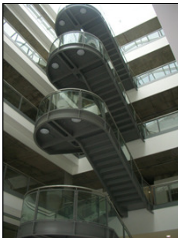
Atrium stair detail – Manor Royal, Crawley