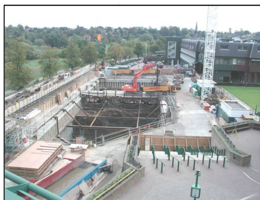
Basement Excavation – AELTCC Lawn Tennis Museum, Wimbledon

Work by Toby Robinson Limited is covered by both Professional Indemnity and Public Liability Insurance